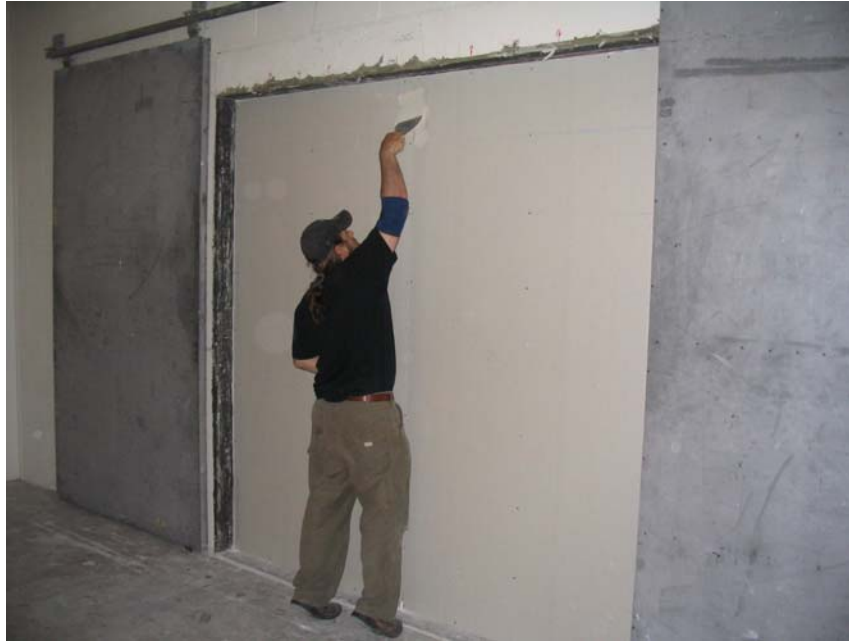
Figure 2: Mudding the center seam