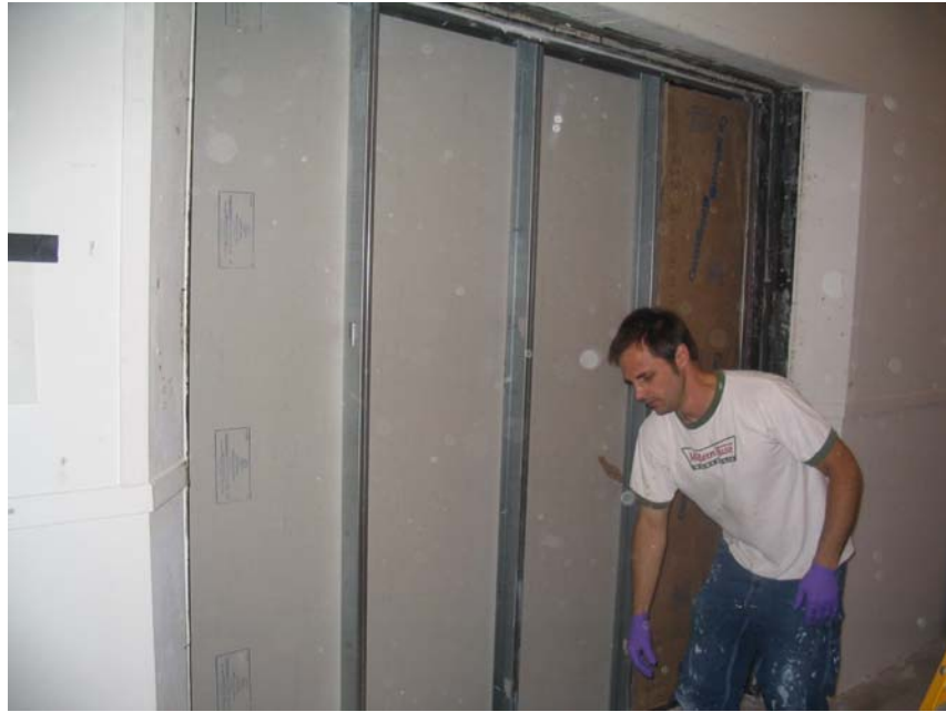
Figure 1: Installing Insulation in Stud Cavities

Dietrich UltraSteel track sections were attached to the test opening at the top and bottom. Dietrich UltraSteel studs were installed vertically at 24" O.C. in the test opening. Type X gypsum boards were fastened to the receive side using 1.25" screws. The screws were placed at 12" O.C at the specimen perimeter and at 12" x 24" O.C. in the field. 3.5" R13 glass fiber batt insulation was fitted into the stud cavities. A photograph of the construction in progress is shown in Figure 1 .